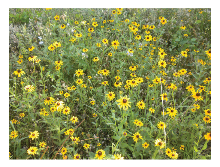
Forest edges and recently burned prairie often contain ample food plants for white-tailed deer such as this rubeckia or black-eyed susan.

Warm season forage: Diverse native plant communities are the most desirable sources of food for white-tailed deer. From early spring to early fall, a mature deer must consume more than 2,200 pounds of forage (including warm season forage, soft mast, and browse). If native plants are deficient, supplemental food can be produced in two to 10 acre plots of cultivated crops (Davison and Graetz 1957). However, the need for food plots is symptomatic of poor habitat, deer exceeding the carrying capacity of the land, or both. Thus, food plots should not be the primary method of managing