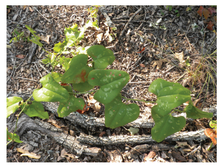
Many species of vines are preferred white-tailed deer food plants. Greenbriar (in the genus smilax) are highly preferred, particularly in late winter. These plants are typically found in highest abundance in open forests, along woodland edges, or in brushy areas of prairies.

times, only half of what is produced will be available for deer consumption. Birds, insects, and other animals will consume the balance (Goodrum et al. 1971). Thus, while important deer food, hard mast is only seasonally available and is not sufficient for deer nutrition throughout the entire year.